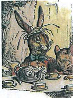
The March Hare from Alice in Wonderland illustrated by John Tenniel

BURTON NEWS THE VILLAGE NEWSLETTER March 2023 Issue 333